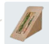
Laminated sandwich packs