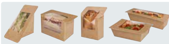
Zest™ Heat Seal and Heat seal packaging range